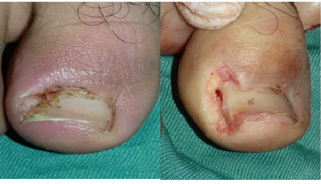
Figure (1): Ingrown toe nails