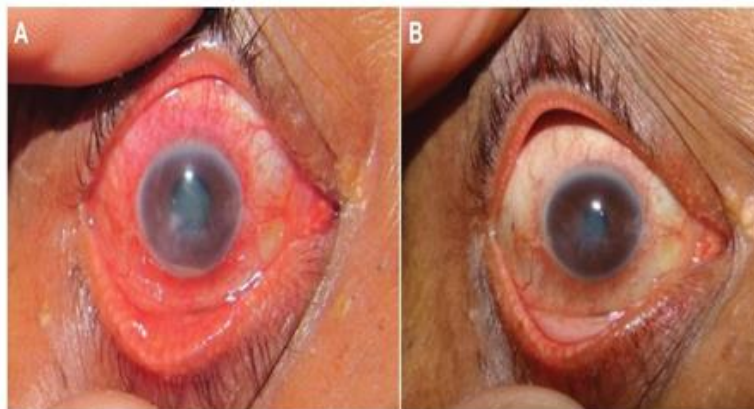
Figure (2): Resistant corneal ulcer associated with hypopyon before (A) and after (B) argon laser adjunctive therapy